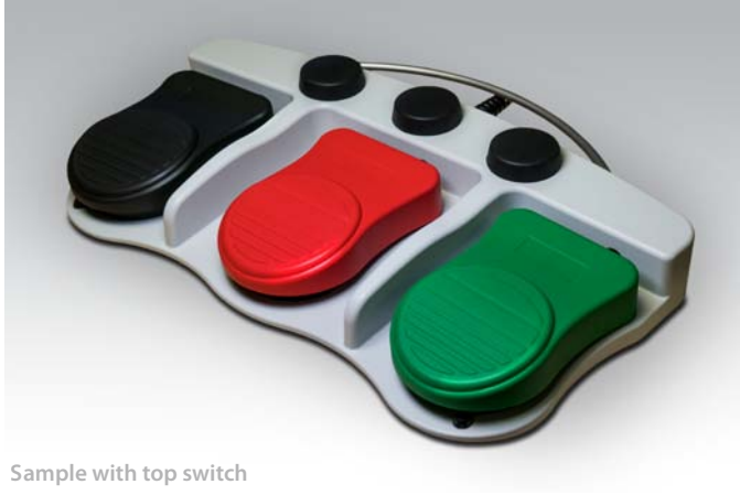
Sample with top switch